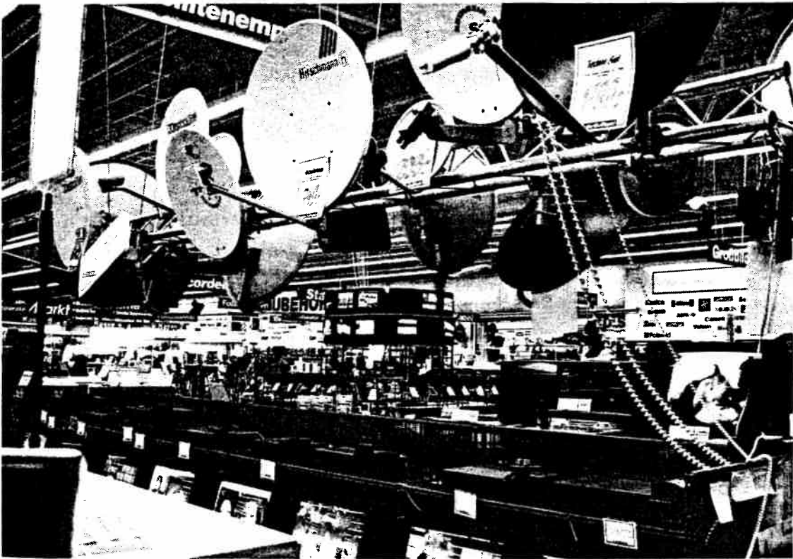
Exhibit 9 MediaMarkt Dietlikon