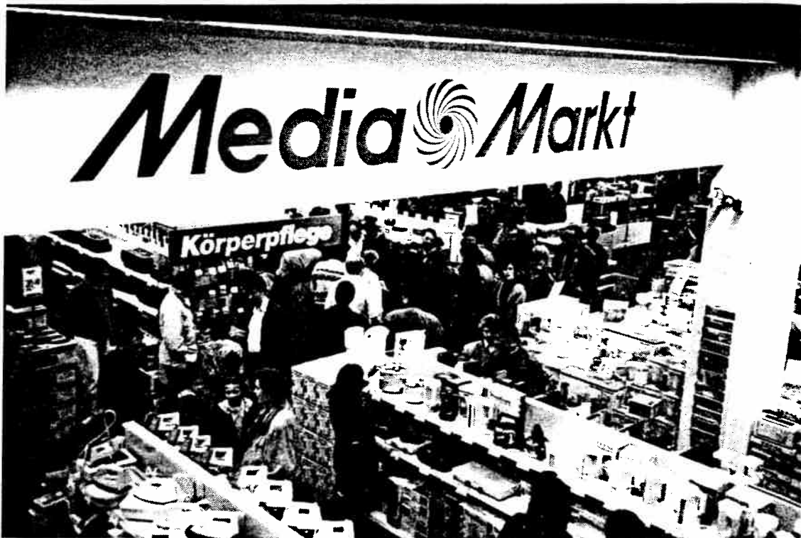
Exhibit 7 MediaMarkt's product presentation