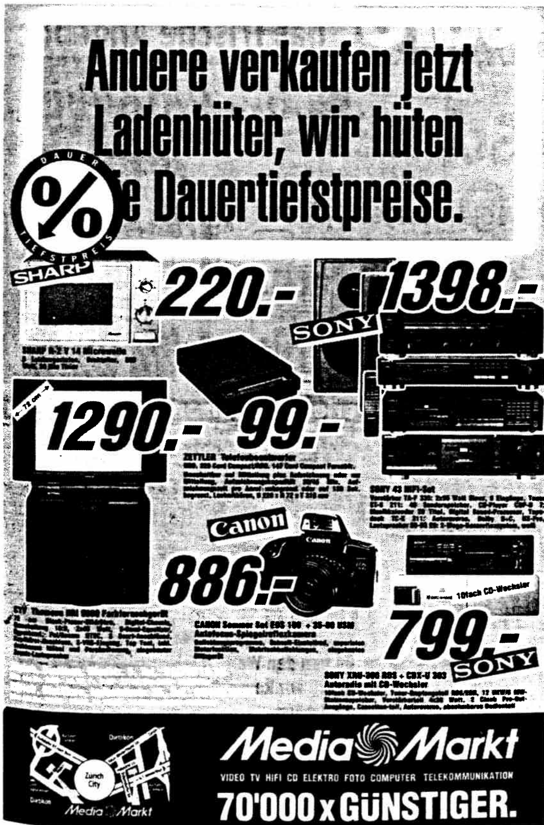
Exhibit 5 Examples of MediaMarkt's advertising campaign